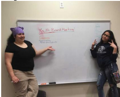
Teens taking Charge!

The Teen Advisory Group (T.A.G.) , held its first meeting over the winter. The group will be helping plan youth led library programs for other teenagers in the Holyoke community. The group is currently in the process of planning a "late night at the library" event, where the library will be open after hours during an upcoming Friday. At this event teens will have the opportunity to watch a movie, eat pizza and snacks, play games, and sing karaoke, and dance.