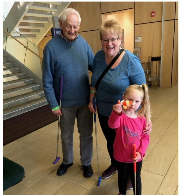
All generations having fun at the 16 th Hole.