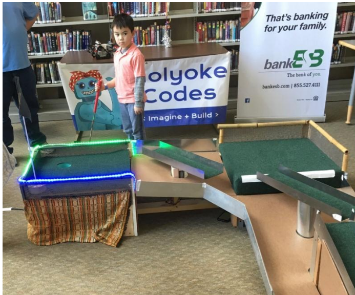
Playing at the animated hole designed by Holyoke Codes.

On Saturday April 6 th , the library hosted the Fourth Annual Mini Golf in the Library fundraiser . Over 350 players registered for mini golf during the day -- our best turnout ever! Additional people (parents, grandparents) accompanied the youngest players, and others came and watched. We enjoyed seeing so many happy faces and hearing praise for the creative decorations (and obstacles) along the course. Thanks to all of the sponsors, donors and volunteers who contributed to the success of this event!