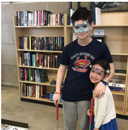
Fun and Face paint at the library!