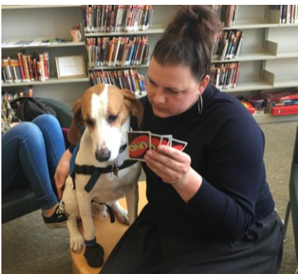
Teens and kids playing UNO with Rooster!