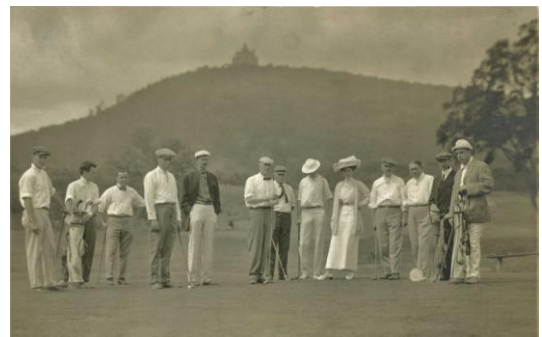
Players at Wycoff Country Club circa 1909.