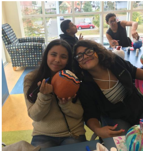
Happy Teens working on their pumpkins!

The library hosted a free 4H Babysitters Training Course over the course of two Saturdays in November. The class had a huge turnout, and youth learned how to start their own babysitting business and keep children safe and entertained, among other things. Due to popularity and a wait list, we are hoping to offer the course again in the Spring.