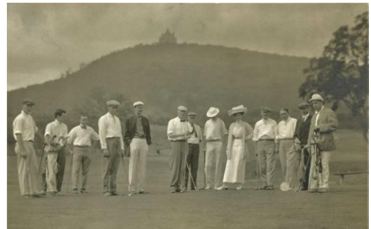
Players at Wycoff Country Club circa 1909.