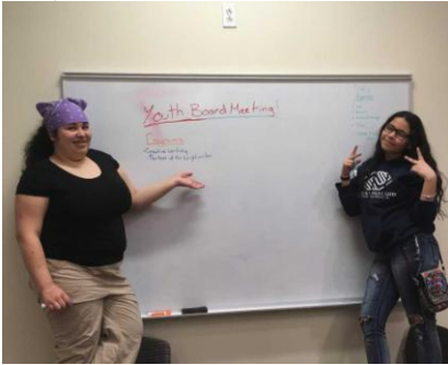
Teens taking Charge!

The Teen Advisory Group (T.A.G.) , held its first meeting over the winter. The group will be helping plan youth led library programs for other teenagers in the Holyoke community. The group is currently in the process of planning a "late night at the library" event, where the library will be open after hours during an upcoming Friday. At this event teens will have the opportunity to watch a movie, eat pizza and snacks, play games, and sing karaoke, and dance.