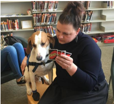
Teens and kids playing UNO with Rooster!