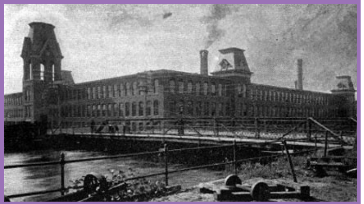
The National Blank Book Company, Holyoke